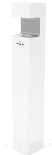
RAL 9003 WHITE

When packaging, we use reinforced cardboard boxes made of five-layer corrugated cardboard (5VVL) and repackage with a combination of fixing materials.