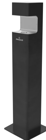
RAL 9005 BLACK